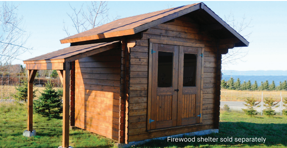
Firewood shelter sold separately